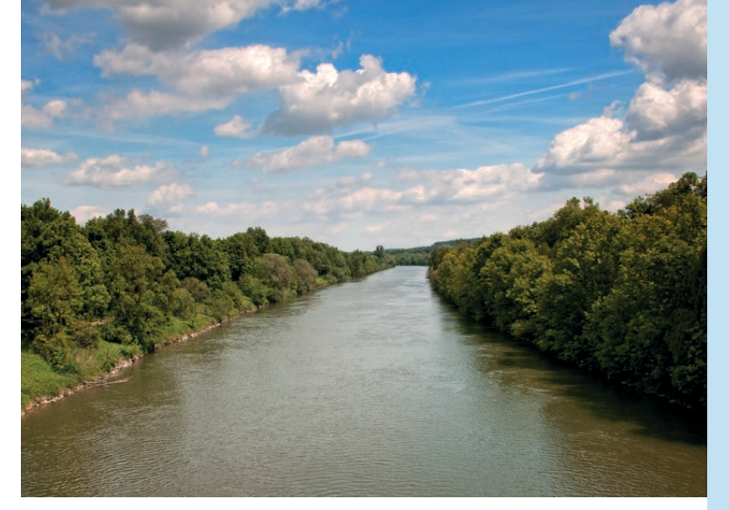
▲ Current state of the fortified and straightened Isar River in Dingolfing